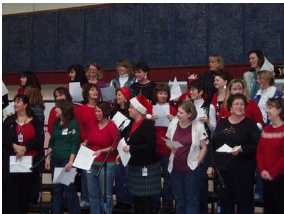
LA teachers singing their little hearts out! December 2009

Tuesday, January 19 th , 2010 at 6:30 p.m. Meet us in the library and register to win a Starbucks gift card!