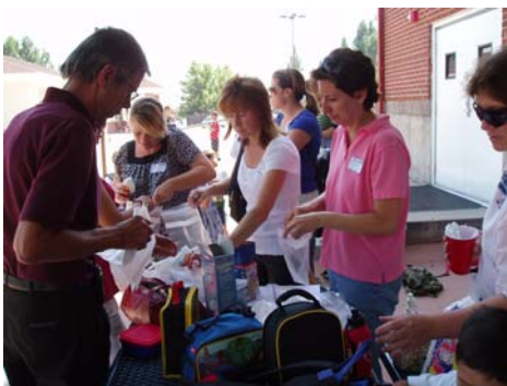
3 rd Grade Family Volunteers 2009

Tuesday, January 19 th 2010 at 6:30 p.m. Meet us in the library to find out what's happening at Lincoln and register to win a Starbucks gift card!